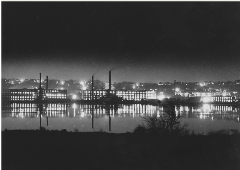
"Brilliantly lighted as their machinery whirs through the night are Fall River's plants engaged in manufacturing products for the entire world."

An image from Everyday Life in Fall River, Mass. , a group of 1930s photographs the FRHS acquired last year.