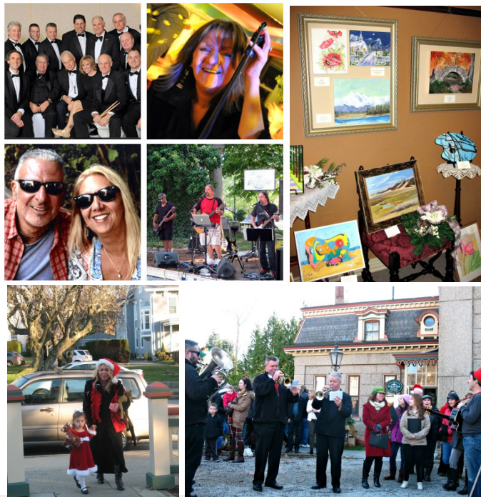
Clockwise from upper left: The performers from the Saturday Evening Serenades concerts; work donated by regional artists to the Palette Pictures exhibit and auction; Sights & Sounds of the Season; arriving for Tea with Mrs. Claus.