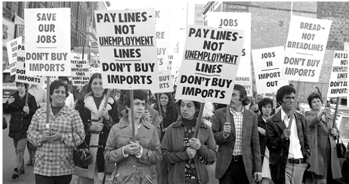
1930s swatch books and cotton fabric samples and an image of garment workers from the Women at Work exhibit.